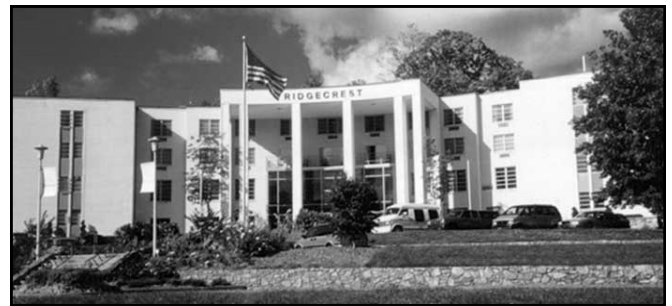
The Ridgecrest Conference Center